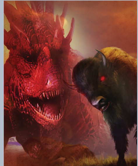
The lamb like beast makes the whole world worship the first beast.

7. Makes the World Worship the Beast: How could this be? The United States, whatever its faults, has always been known for religious liberty. However, in times of national crisis, our liberties can disappear. It has happened before - during the Civil War and the First and Second World Wars. After 9/11, the United States, fearful and angry, passed the Patriot Act, giving the government powers that under normal circumstances it would never allow. In times of crisis, things change. Imagine if there were to be another terrorist attack, a nuclear one. Everything could change, and the nation known as the bastion of religious freedom could easily start to “speak like a dragon.”